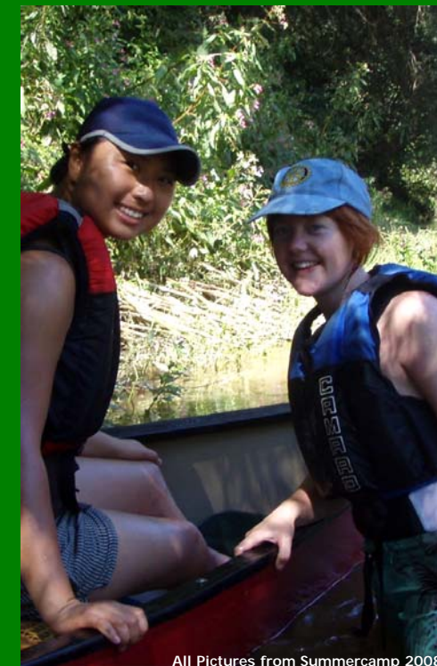
All Pictures from Summercamp 2008