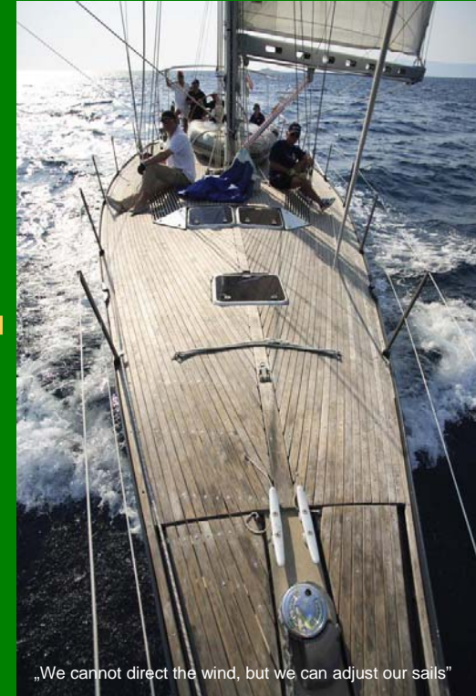
„We cannot direct the wind, but we can adjust our sails“