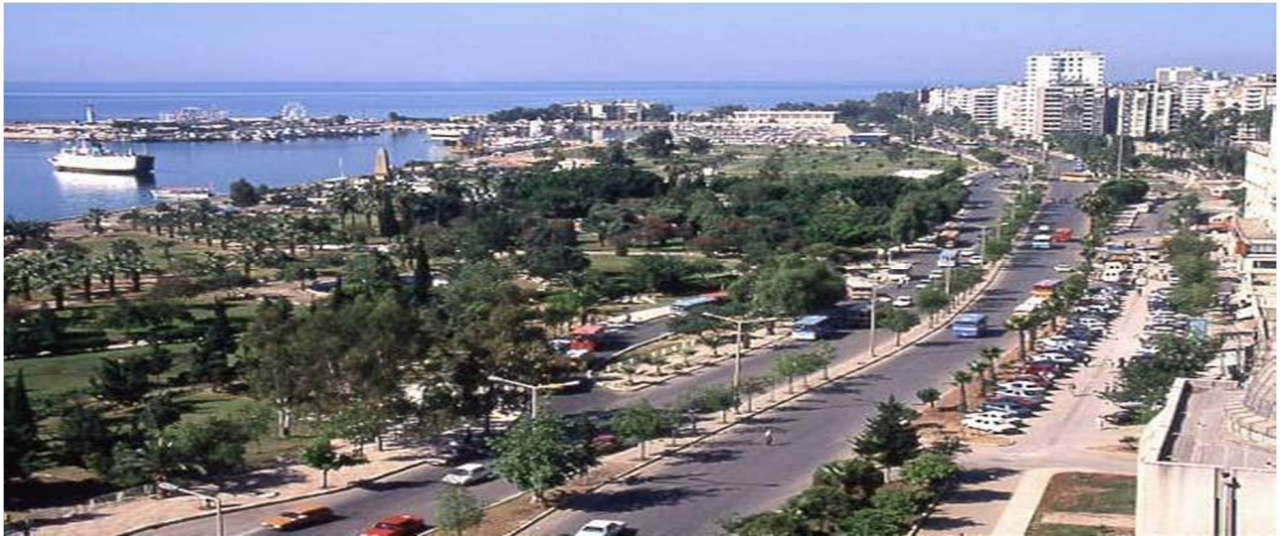
WELCOME TO MERSIN